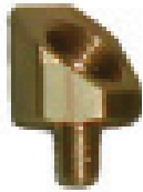
Adaptor 45° 1/4BSP F - 6mm M GF13006