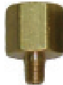
Adaptor Brass 1/4BSP F - 1/4UNF M GF14014