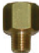
Adaptor Brass 1/4BSP F - 1/8BSP M GF14018

Brass adaptors also available: 1/4BSP F - 6mm x 1 GF14006 1/4BSP F - 8mm x 1 GF14008 1/4BSP F - 8mm x 1.25 GF14009 1/4BSP F - 10mm x 1 GF14010