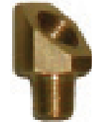
Adaptor 45° 1/4BSP F - 1/8BSP M GF13018