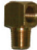
Elbow 90° 1/4BSP M&F GF12000

Brass adaptors also available: 1/4BSP F - 6mm x 1 GF14006 1/4BSP F - 8mm x 1 GF14008 1/4BSP F - 8mm x 1.25 GF14009 1/4BSP F - 10mm x 1 GF14010